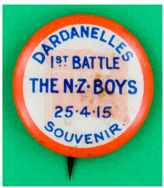
Fig. 2. A version of the Dardanelles Button, 1915

The Caversham nursing division of the St John