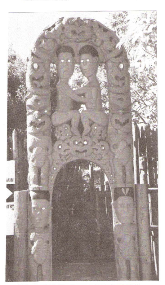
TUTANEKAI AND HINEMOA Model Pa, Whakarewarewa 1995