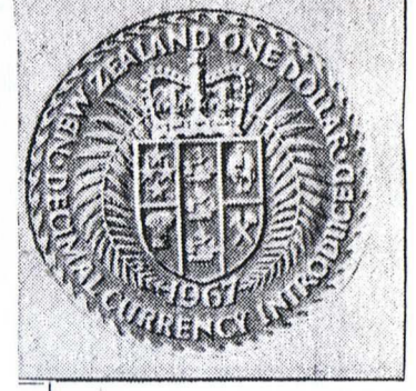
977, coat of arms, W. Gardner