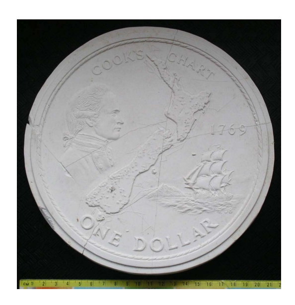
Plaster model of 1969 "Cook" dollar by James Berry (actual size 21 cm) Private collection

Within a year or two mechanical adding machines were changed over to electronic and bookkeeping machines were replaced by computers.