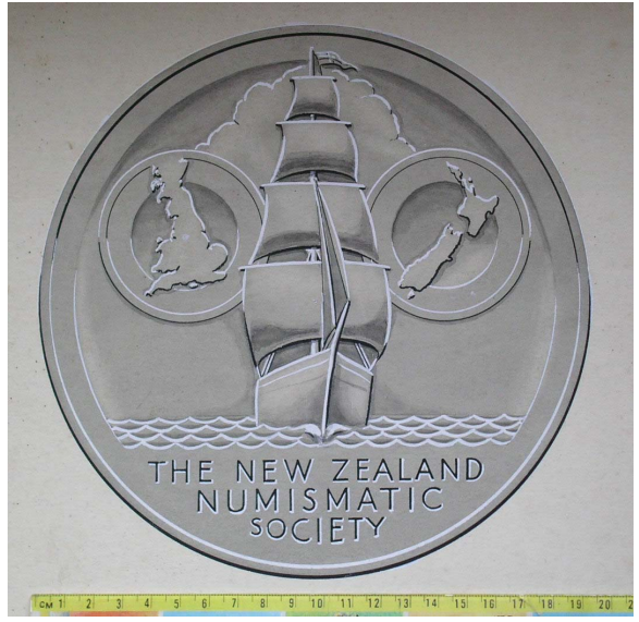
Outline of NZ Day dollar by James Berry in plaster (?) between glass RNSNZ Collection