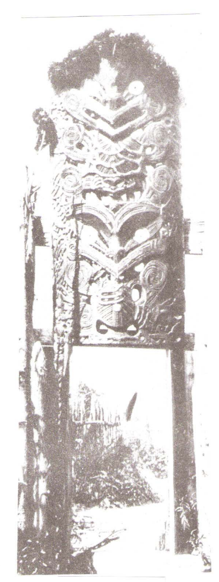
GATEWAY Maketu Pa, 1865