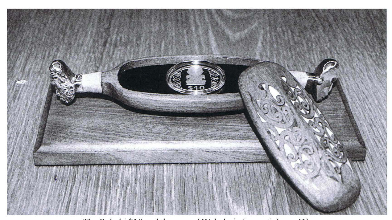
The Pukaki $10 and the carved Wakahuia (see article, p. 41)