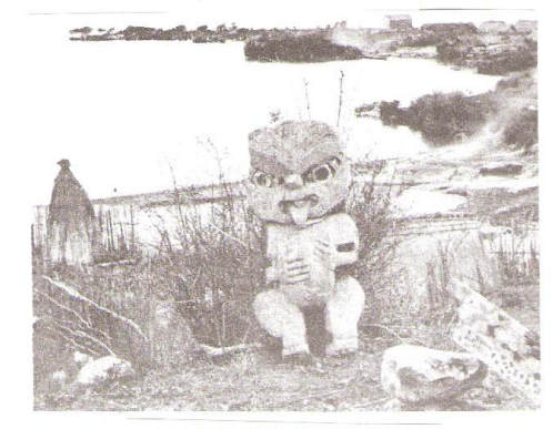
GATEWAY FIGURE? Ohinemutu 1870