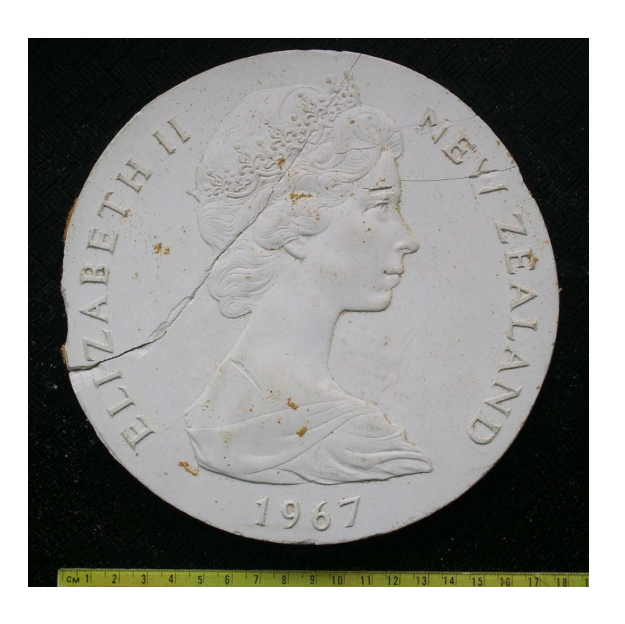
Plaster model of 1967 NZ obverse design by Arnold Machin (actual size 18 cm) Private collection