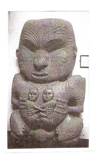
PUKAKI Auckland War Memorial Museum 1980