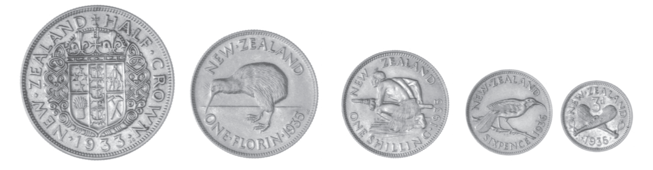
1-5: New Zealand reverses: George Kruger Gray, half-crown, florin, shilling, sixpence and threepence, circulating coinage designs used from 1933 (University of Otago)

New Zealand was the last Dominion to adopt her own coinage, which was phased in for silver denominations from the half-crown to the threepence between November 1933 and April 1934. (PI. 1-5) The economic circumstances behind their introduction are well documented, but the history, design, iconography and critical reception of the coins have received surprisingly little numismatic and no art historical attention. This is partly due to the admirable summary in Numismatic History of New Zealand (1941), by Allan Sutherland, who was closely involved in the design selection process.¹ Certainly the 1933 designs aroused little of the intensely lively debate and media attention that would accompany their replacements, the 1967 decimal coinage reverses.