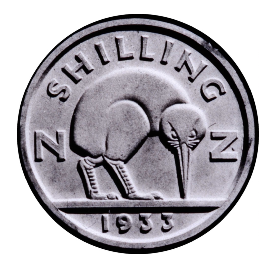
11-12. Percy Metcalfe, shilling designs, 1933

In comparison, the normally consistent Kruger Gray's kiwi and kowhaiwhai design looks ludicrously inept. (PI. 13) At the Advisory Committee meeting, however, the latter was 'generally liked, the representation of the bird in particular being approved by the representatives of New Zealand.'<sup>54</sup> When he saw the design and its first revision several months later, Sutherland reacted very differently and described them as 'going from bad to worse. The carvings and ground representations did not improve the design and are better out of the way. The feathers are supposed to be spotted, but really look like fish-scales.'<sup>55</sup> In his Numismatic History of New Zealand , he likened Kruger Gray's kiwi to 'a pine-tree cone' and claimed that 'the average New Zealander would not accept this as an accurate representation of the national wingless bird.'<sup>56</sup> In mitigation, Sutherland recognised that the 'kiwi is not a handsome bird' and appreciated the challenges that its shape and proportions posed to 'non-Kiwi' designers.<sup>57</sup>