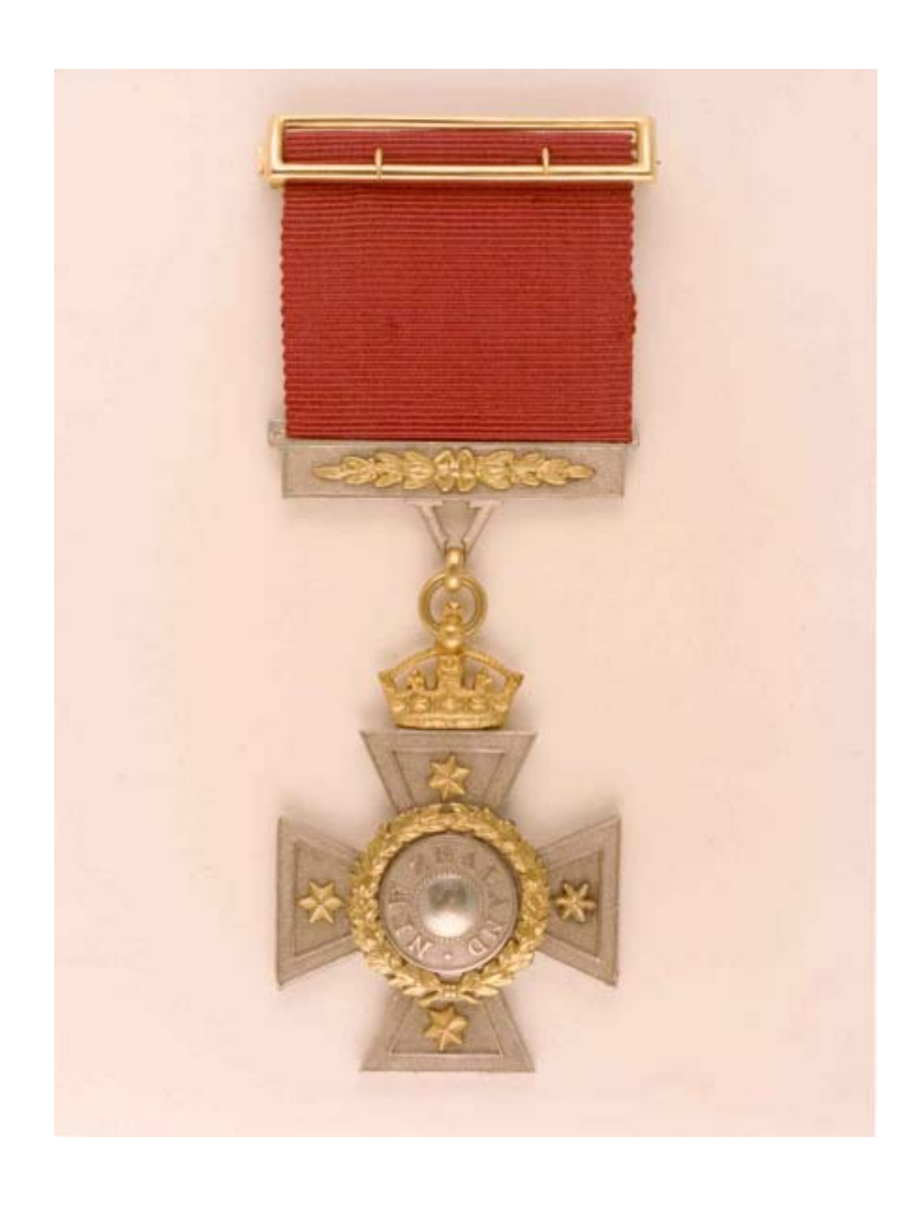
The New Zealand Cross (1869 version) - see accompanying article, "Surprise Attack" (pp. 9-10)

Illustration courtesy of John Wills, from his book "Zealandia's Brave" (2001).