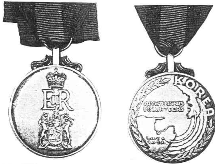
The Korea Medal 1950 - 1953