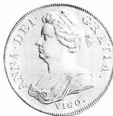
Anne 5/- 'VIGO' below bust