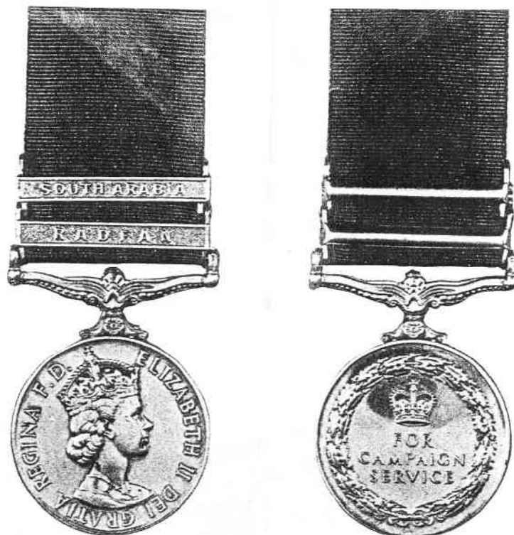
The General Service Medal 1962