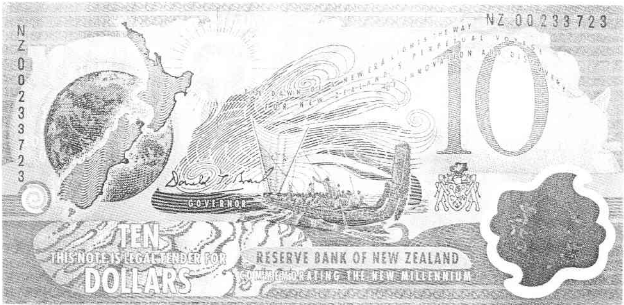
The New Zealand $10 “Millennium” note, expected to be released for circulation in the second half of 2000