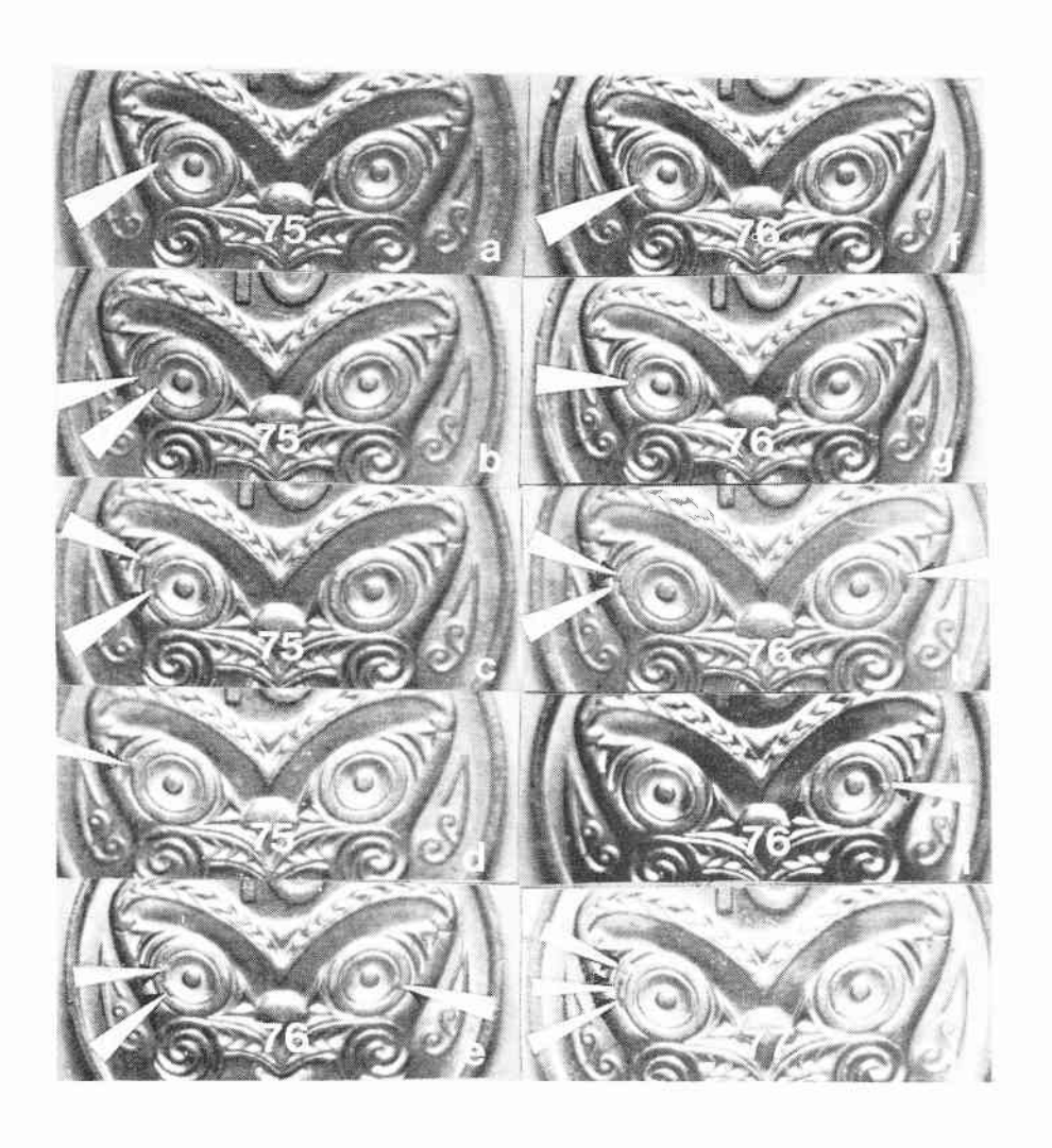
Figure. 1. Varients identified to date of the stye-eyed Koruru variety.

Thanks are due to the numerous tellers who endured our constant changing of ten cent pieces over the early months of 1979.