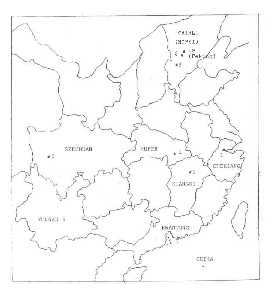
Figure 1. Mints at which the coins in the Ranfurly Hoard were struck