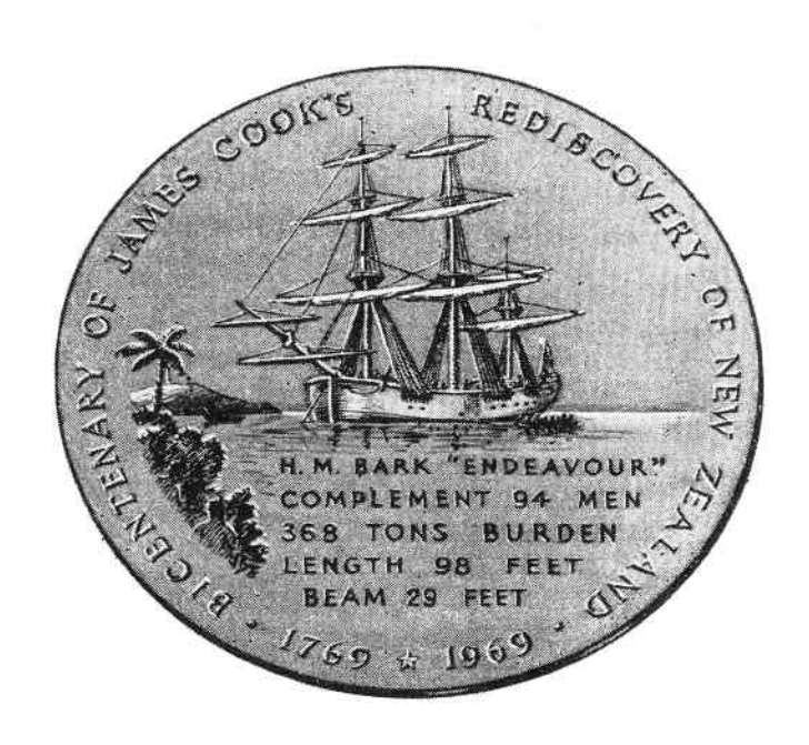
PLATE XIV: Obv. and Rev. Royal Numismatic Society of New Zealand Cook Bicentenary Medal, 1969.