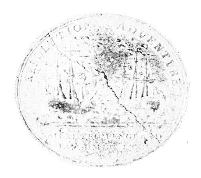
PLATE III: Obv. and Rev. Resolution and Adventure Medal, 1772. Basemetal specimen found at Otanerua Bay on Arawapa Island in Queen Charlotte Sound, 1860.