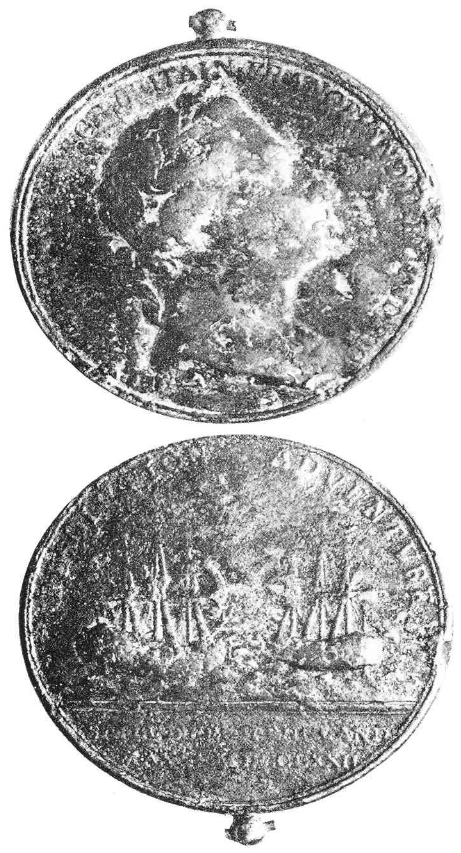
PLATE IV: Obv. and Rev. Resolution and Adventure Medal, 1772. Basemetal specimen found at Murdering Beach, Otago Heads, 1863. (N.B. This is an upset medal.)