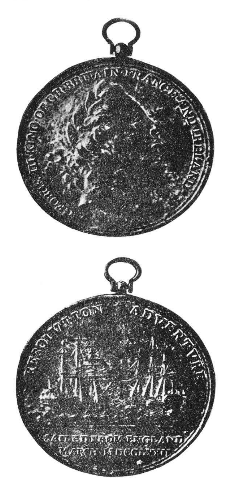
Obv. and Rev. Resolution and Adventure Medal, 1772. Basemetal specimen found at Rams Head, Tawhitinui Reach, Pelorus Sound, 1896. PLATE V: