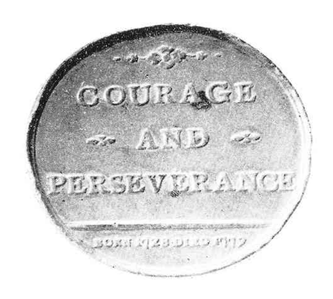
PLATE X: Obv. and Rev. Cook Memorial Medal. n.d.