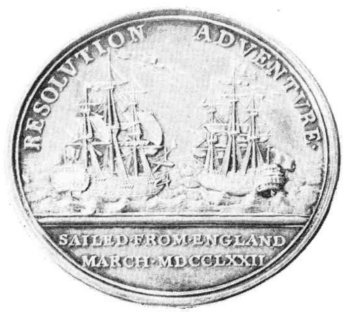
PLATE II: Obv. and Rev. Resolution and Adventure Medal, 1772.