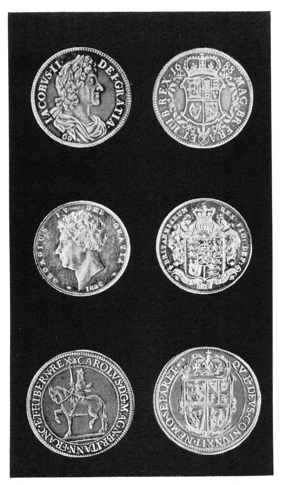
CROWN PIECES FROM THE JAMIESON COLLECTION.

Specimens from this collection, which includes 2,500 crowns issued in all countries during the last 400 years, were exhibited in Auckland during the Coronation. Above: Pattern crown or 60s piece James VII of Scotland (II of England); Centre: crown of George IV of England; Below: Crown or 60s piece of Charles I, Scotland, by Briot.