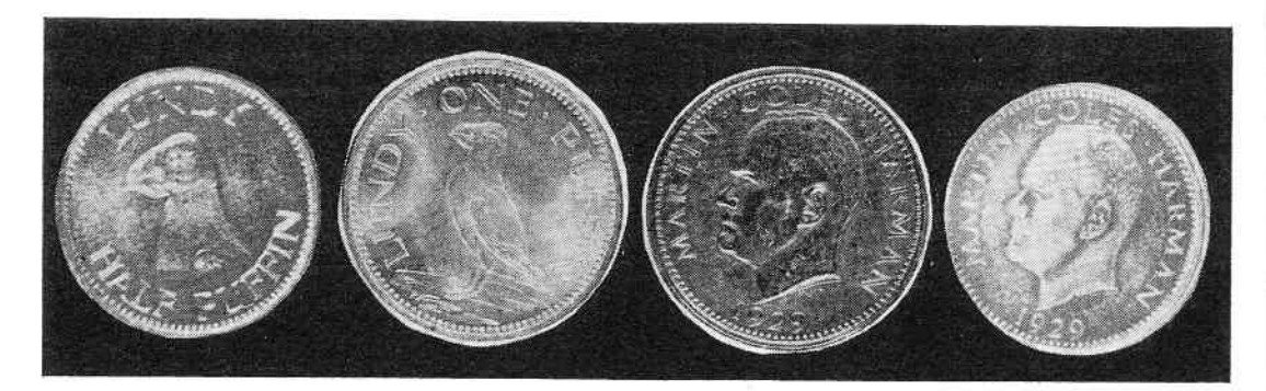
Lundy Island: Puffin and half Puffin.