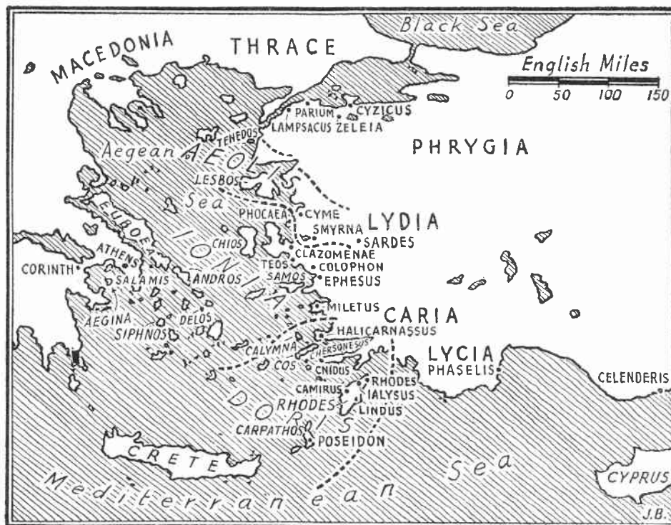
Map of the Aegean region, showing the position of the chief places mentioned in the articles on Ancient Coins.

The House of Representatives in New Zealand also asserts its independence in another form by granting a first reading of a mythical "Expiring Laws Continuance Bill" as the first business of a new session. The Bill is never "ordered to be printed" by the House, as in the case of other Bills. This is not done as an act of defiance, but, as May states, "in order to assert their right of deliberating without reference to the immediate cause of summons," that is, to deal with their own business before taking into consideration the King's business referred to in the Speech.