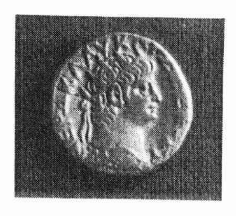
Obverse of Alexandrian "silver" Tetradrachm of Nero.