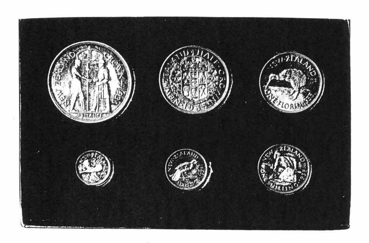
1935 Waitangi Proof Set in cardboard box of issue.